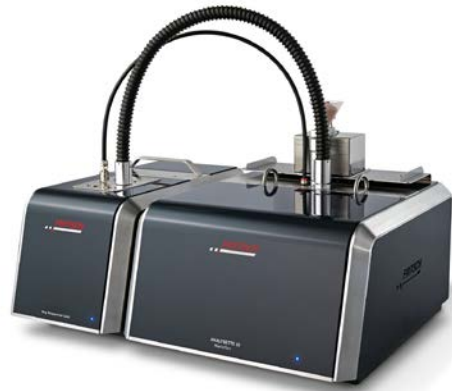
Fig. 1 : ANALYSETTE 22 NanoTec with dry dispersion unit

The sieve analysis is due to good reason no ICC-standard method, because it cannot be standardized. Especially since the moisture fluctuations of the sievings cause a substantial degree of errors, equally to the different flow characteristics. The quality of the sievings depend on it and never achieve 100 %, here an endless long sieving period would be required, especially if several sieves are below one another. Two steps are carried out in trying to improve the reproducibility of a sieve analysis of flour. First, with only one sieve the finest material for example below 90 µm is sieved off and in a second step, the now better flowing throughput is sieved with the remaining sieve set. A better reproducibility which can be universally used to determine the particle size distribution of all intermediate and final milling products. It is suitable for the use in quality control and process control. Through the flexible programmability of the entire dispersion and measuring process it is very well suitable in the areas of research and development.